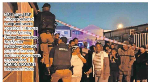
CAPE Town LEAP officers conducted a stop-and-search operation in Hanover Park on Saturday. During the operation, ShotSpotter technology detected gunfire in the area, and three people were reported shot.