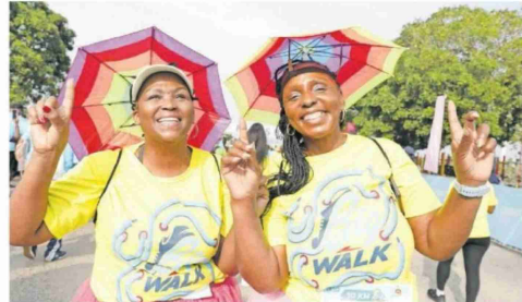
THOUSANDS of walkers took part in the Suncoast East Coast Radio Big Walk along Durban's beachfront on Sunday, tackling 5km and 10km routes from uShaka Marine World to People's Park at Moses Mabhida Stadium. The annual event, supported by the Saturday Star 's sister paper, the Daily News as a media partner, brought together families, fitness enthusiasts and corporate teams in a show of community spirit.