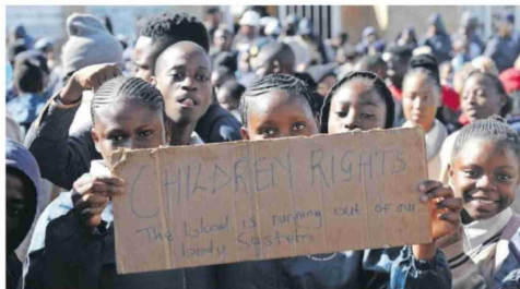
LEARNERS, parents, and political parties protested outside Soshanguve South Secondary School on Wednesday, demanding the principal's resignation after a viral video showed pupils being beaten with broomsticks by alleged community policing forum members.