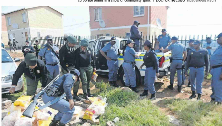
POLICE officers raid Diepkloof hostel in Soweto following violent protests that claimed two lives. The unrest, sparked by poor living conditions, also led to the looting of food and alcohol from passing trucks.