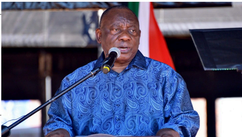
President Cyril Ramaphosa