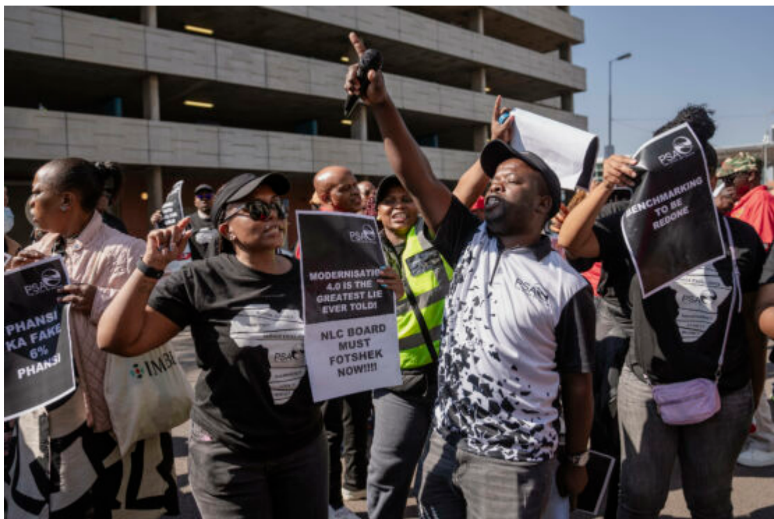
NLC employees marched to the offices of the Department of Trade, Industry and Competitiveness in Pretoria this

By Ihsaan Haffejee, GroundUp · 9 May 2025 ⌚ 04:01