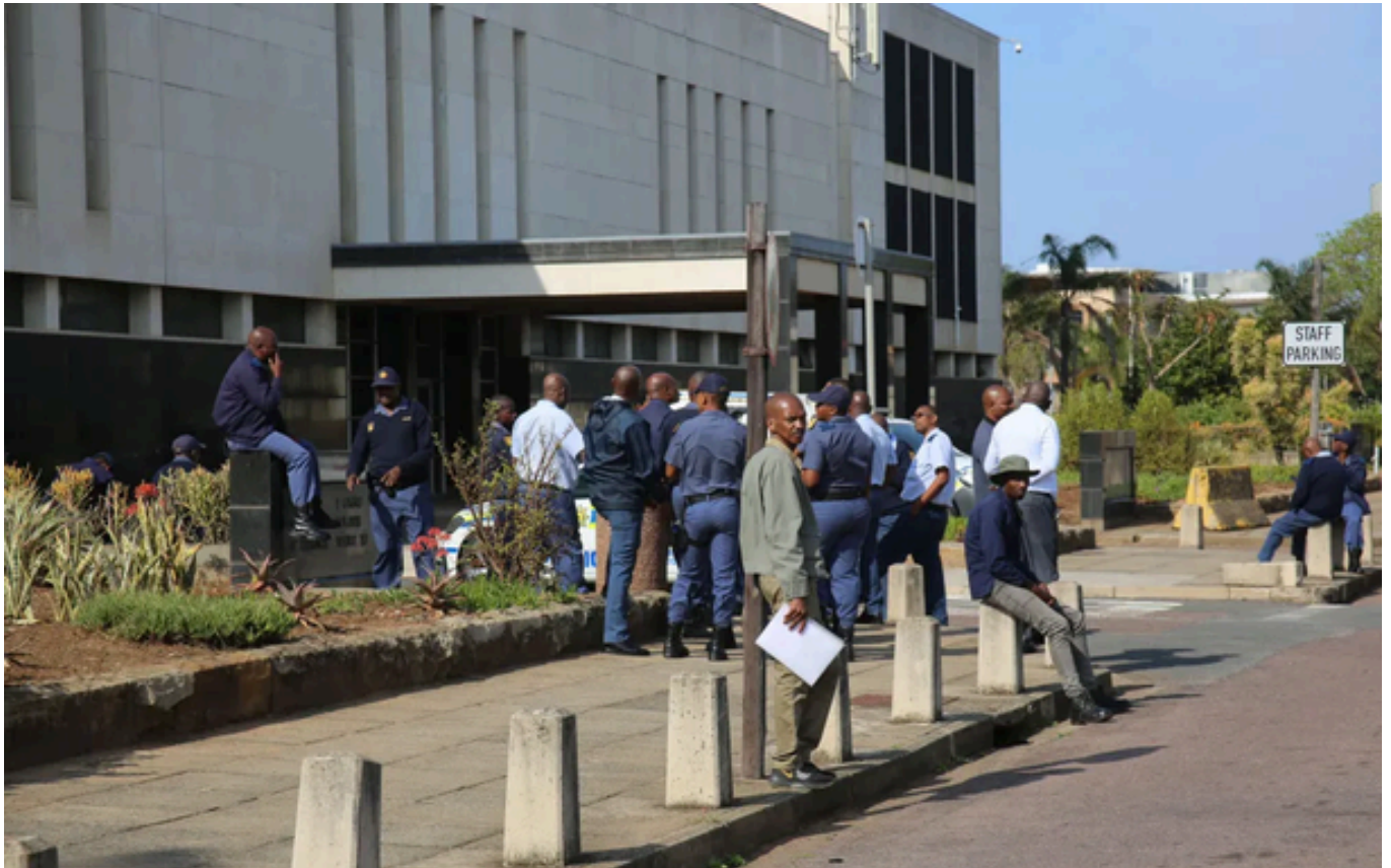
Police standing outside Durban Magistrates Court as there was a bomb threat.

Others were leaving and warning people going towards the court building that there was a bomb.