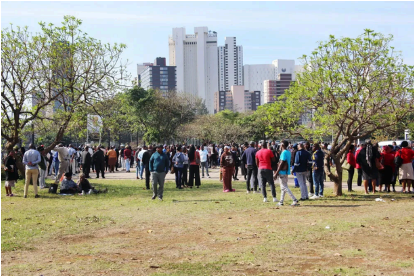
Staff members of the Durban Magistrate's Court and the public standing outside after being evacuated due to a bomb threat.

Recently, the Sunday Tribune reported that labour unions have called for the immediate closure of the building after the Department of Labour had allegedly not done anything to address its issues.